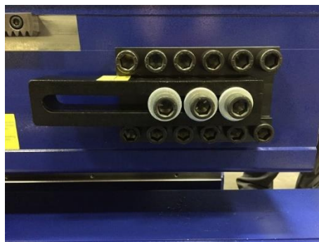
Fastening of stop rail with required 500 Nm tightening torque