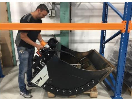
Fastening for construction & construction machines