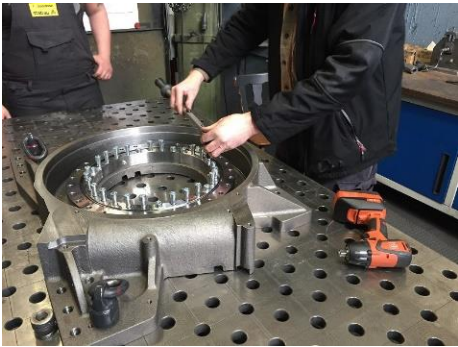
Fastening fork lift truck swivel joint with cast housing