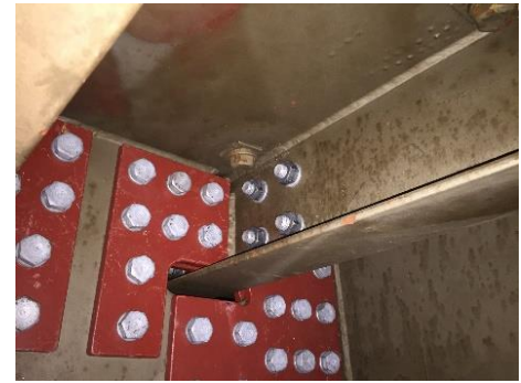
Bridge renovation, reinforcement