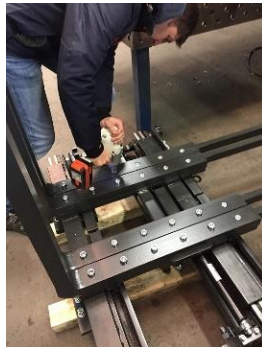
Fastening fork lift arm attachments